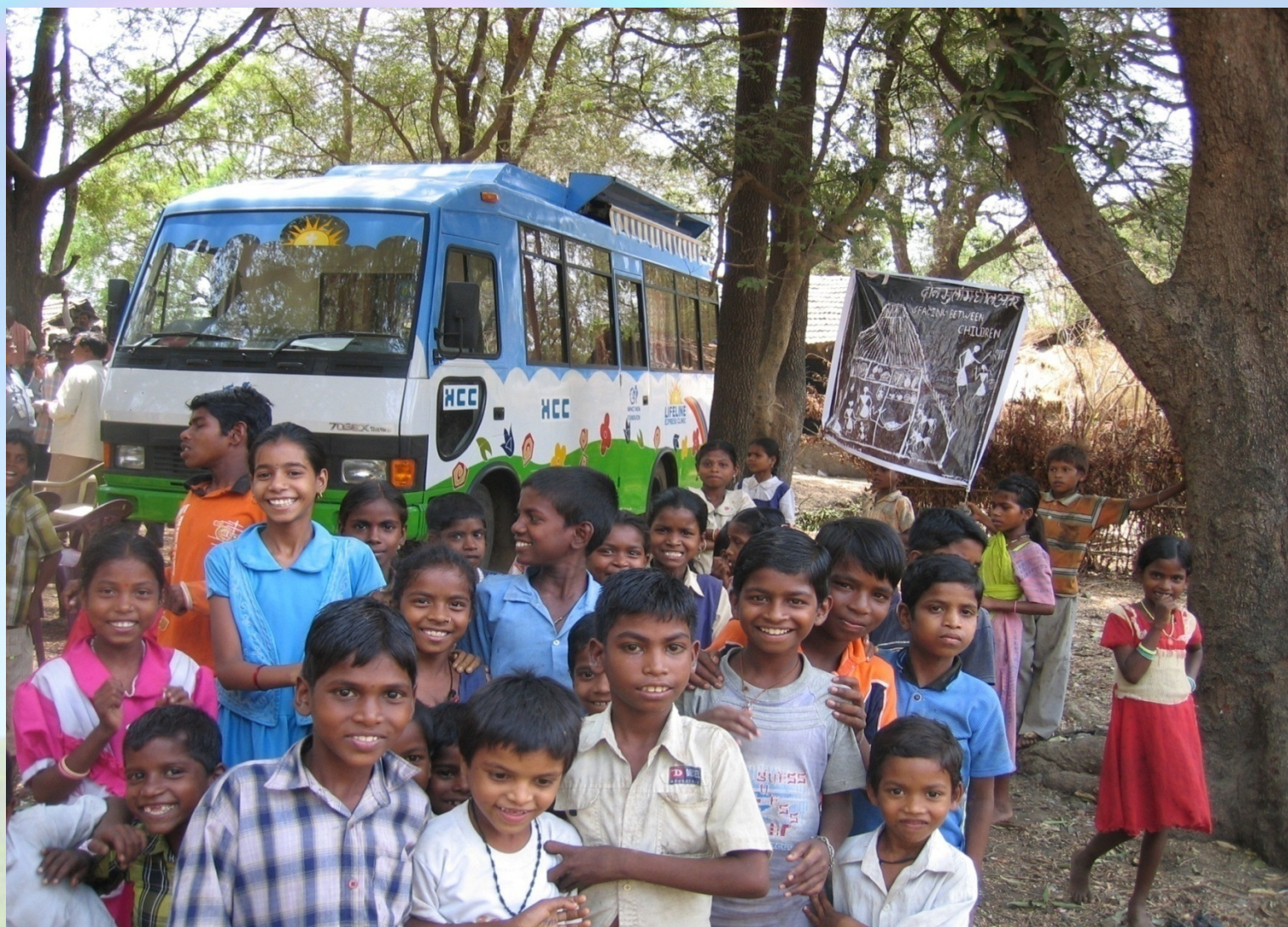
Children waiting to be tested for vision and hearing on the Lifeline Express Mobile Clinic