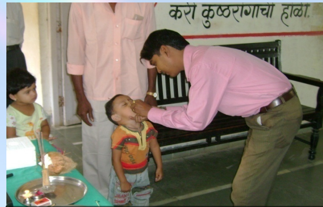
Being immunised against polio