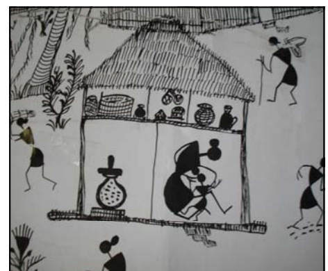
A poster depicting the importance of breast feeding