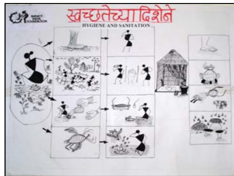
A poster depicting the importance of hygiene