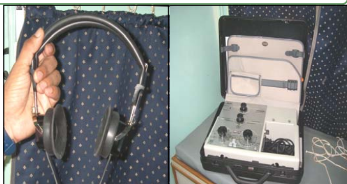
Audiometry set on the Lifeline Express Mobile Clinic for early detection of hearing disability