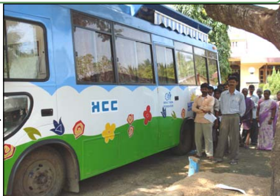
Children and adults waiting outside the bus to be screened.

Co. Ltd. has sponsored another Lifeline Express Mobile Clinic which has commenced screening activities to complement the efforts of the first bus.