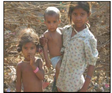
Malnourished children in the CHI

Through community sessions there is an increase in awareness on existing Government schemes, like the Matrutva Anudan Yojana (Motherhood Assistance) and the Janani Suraksha Yojana (Safe Delivery Assistance) to encourage the tribals to access and demand their rightful benefits through community mobilisation and demand creation.