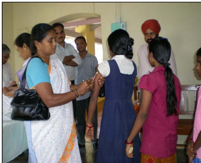
(left and above ) Immunisation of adolescent girls against Rubella in progress at Maswan Primary Health Centre, Palghar

The screening of eligible girls is conducted by Gynecologists and Paediatricians at the Rural Hospital, Sub District and Civil Hospitals.