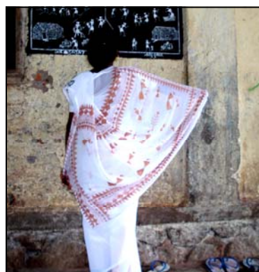
A health worker displaying health message painted on her sari

Community action will promote nutrition and regular health check-ups for pregnant women, mothers and infants. Tribal women are also trained to prepare nutritious food from locally available ingredients. Twenty nine sessions have been held, attended by 2384 persons and 23 core groups have been formed to disseminate relevant information.