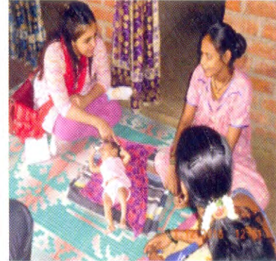
Nutrition Advice for the CHI staff