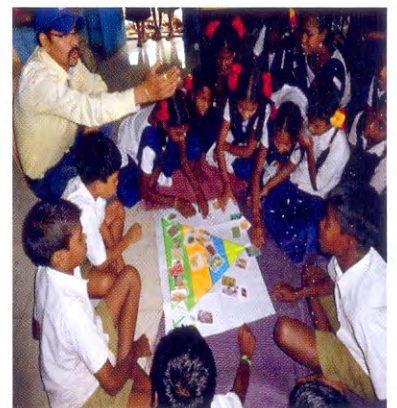
Students of Class III learn about balanced diet through the Food Pyramid Game at Zilla Parishad School Valve, Somta.