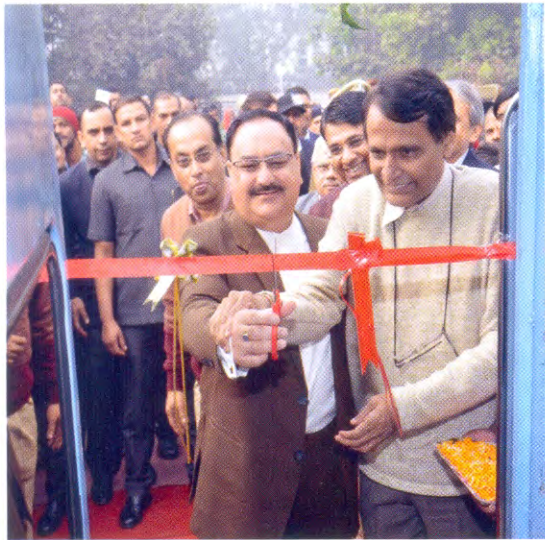
Left to Right: Mr. J.P. Nadda, Minister for Public Health & Family Welfare and Mr. Suresh Prabhu, Minister for Railways

Inauguration of two additional coaches of the Lifeline Express (LLE) for Cancer Detection and Family Health on 8 th December 2016