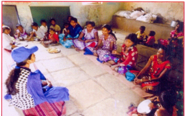
Health & Nutrition Education for Non-School Going Adolescents

CHI at Somta PHC - Adolescent Girl & Nutrition - The Jamsetji Tata Trust has sanctioned support of Rs.276 lakhs towards the scaling up of the CHI in the Somta PHC area of Palghar District as well as travels, and Budget deficit of the Dasra Giving Circle sponsored projects at Sakharshet & Malvada