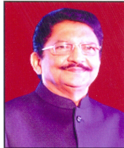
Ch. Vidyasagar Rao GOVERNOR OF MAHARASHTRA

We are grateful to our many benefactors who have generously contributed towards the LLE.