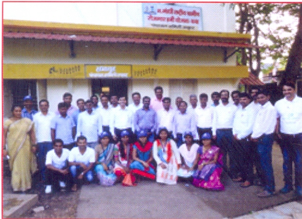
Training of School Teachers on Health & Nutrition

Project on Broadband Connectivity in Palghar District: IIF will partner with the Tata Social Welfare Trust and IIT, Bombay, in an 18 month pilot project "Broadband Connectivity to Rural and Underserved Regions using TV UHF Band: Outreach to 25 Villages in Palghar District of Maharashtra. The project will enable the broadcast of content through internet wi-fi connectivity and an easy to use interface, made accessible through a simple TV set and remote.